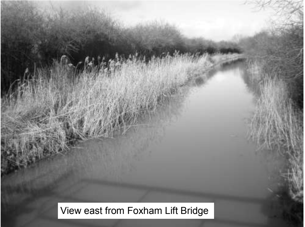
View east from Foxham Lift Bridge

have continued to make progress while the rainfall has tested the with their clearance around the holding capabilities of the section Elephant spillway (near Christian between Foxham and the Elephant. Malford), often in the most atrocious In Dauntsey Lock, work conditions. Despite the wet, and (presumably reported in more detail even in the rain, they manage to elsewhere) is progressing on the