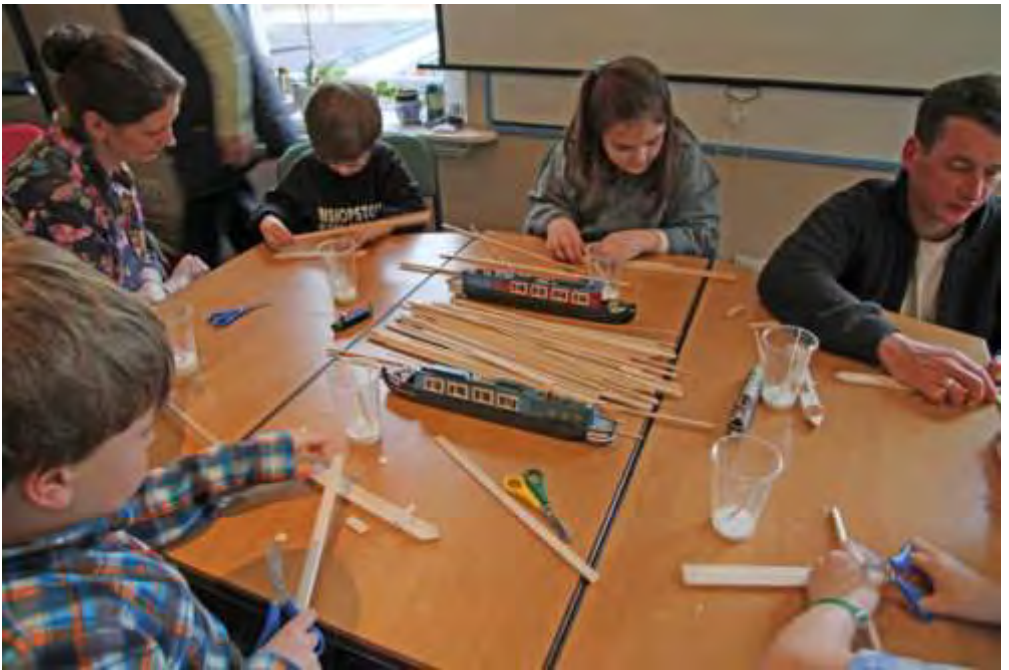
Build your own boat (above) and make your own lace plate below) - See page 13