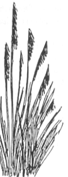
Common Reed (Phragmites)